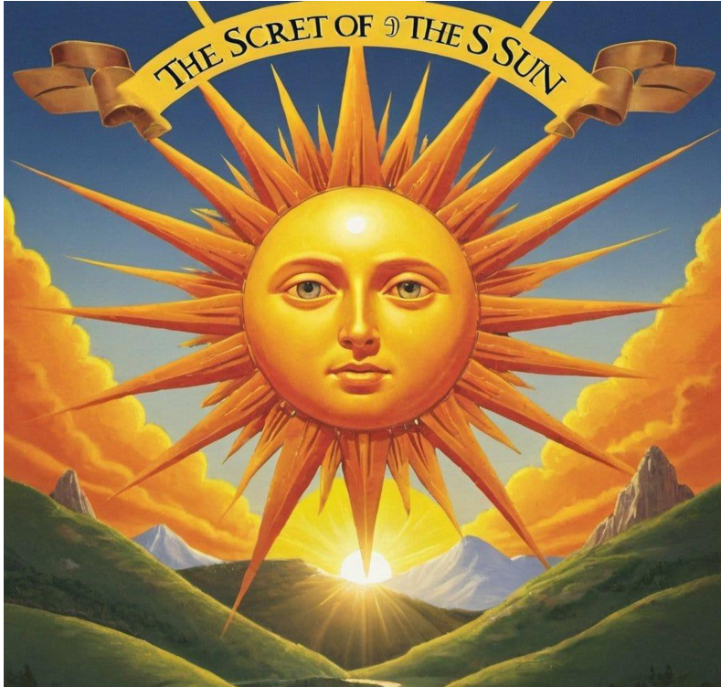
Ai Art by King Spiros of Plomari ~ ArtSetFree.com