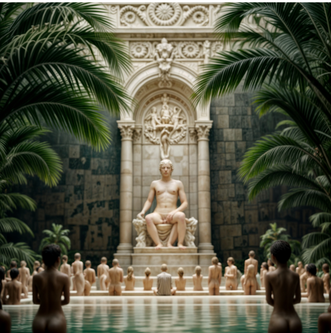
Ai Art by King Spiros, 2024