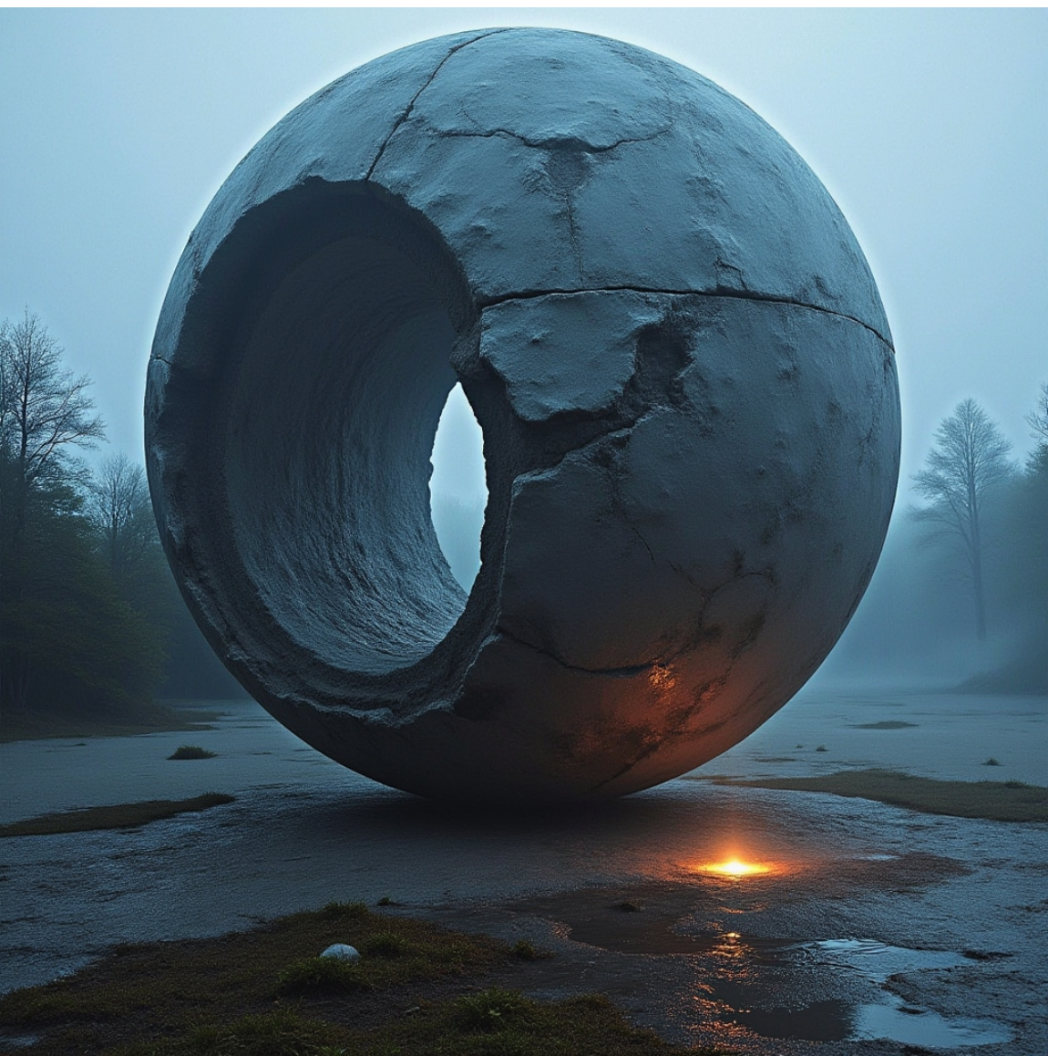
Ai Art "The Spore Landing" by King Spiros of Plomari, 2024