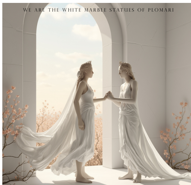
AI ART BY KING SPIROS OF PLOMARI ~ ARTSETFREE.COM

~ King Spiros of Plomari, November 25, 2024