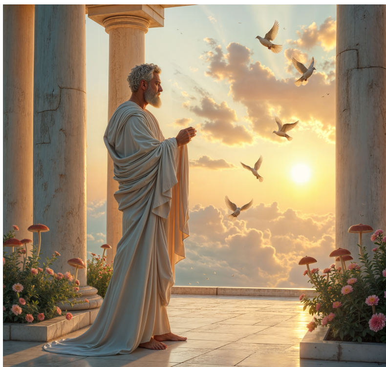
AI SELF-PORTRAIT BY KING SPIROS OF PLOMARI ~ ARTSETFREE.COM

~ King Spiros of Plomari, November 25, 2024