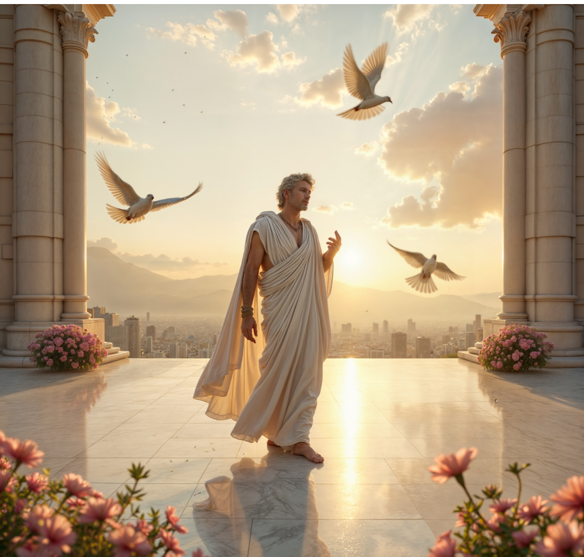
AI SELF-PORTRAIT BY KING SPIROS OF PLOMARI ~ ARTSETFREE.COM