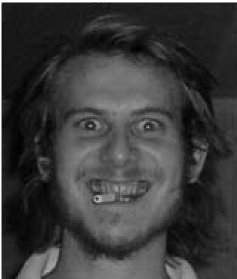
THE HISTORICAL PHOTO WHEN KING SPIROS OF PLOMARI GOT HIS WORLD FAMOUS IDEA, 2006