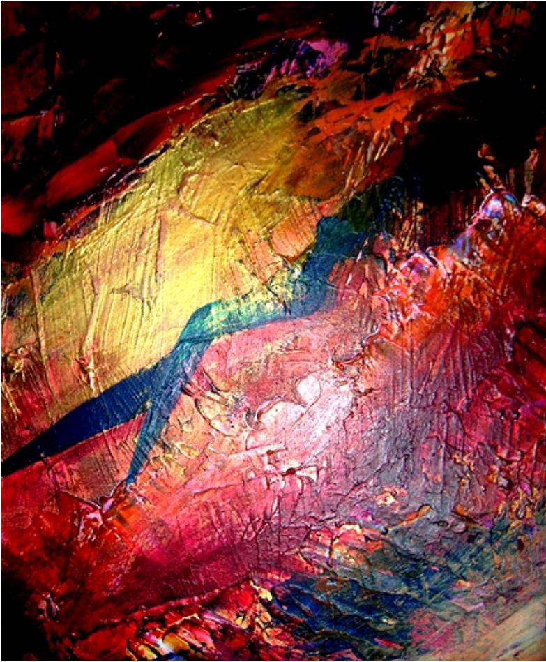
Painting by King Spiros of Plomari, acrylic on canvas, year unknown