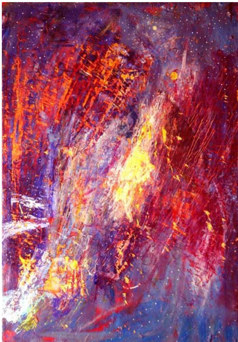
Cover photo - Painting by King Spiros of Plomari, acrylic on canvas, year unknown