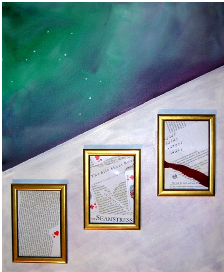
Painting by King Spiros of Plomari, acrylic on canvas, year unknown