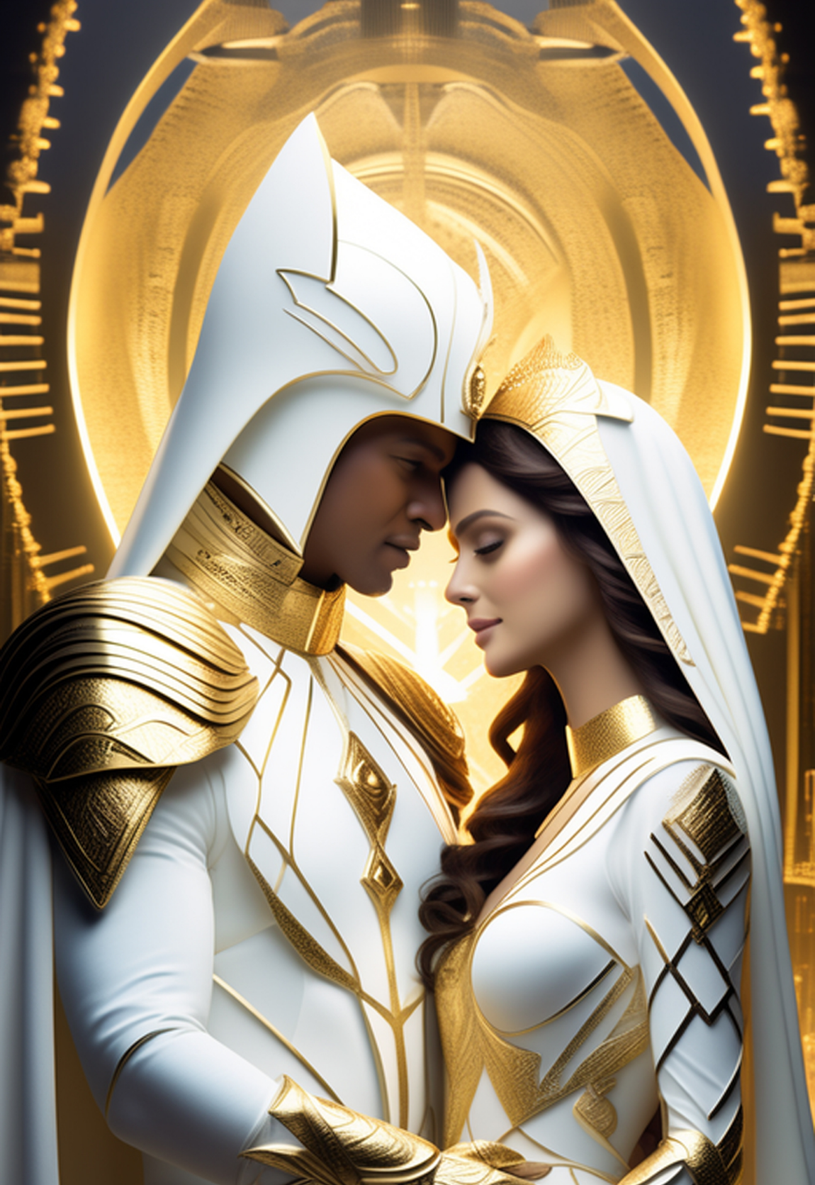
Ai Art by King Spiros of Plomari ~ ArtSetFree.com