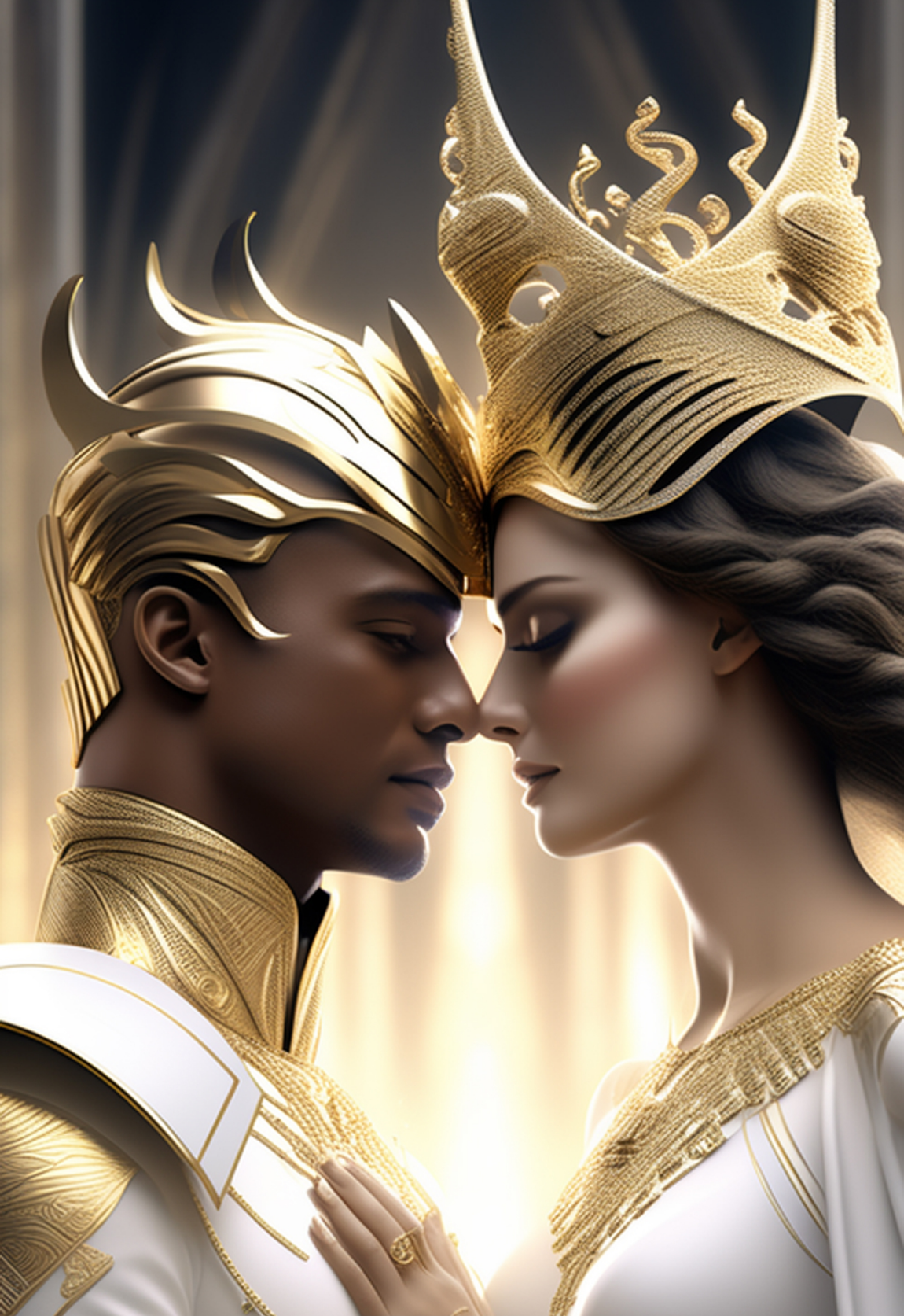
Ai Art by King Spiros of Plomari ~ ArtSetFree.com