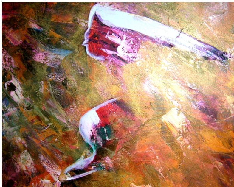
Painting by King Spiros of Plomari, acrylic on canvas, year unknown