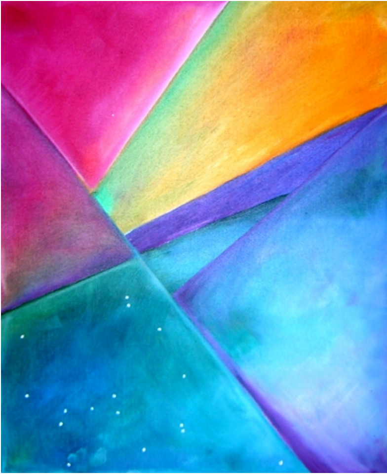
Painting by King Spiros of Plomari, acrylic on canvas, year unknown