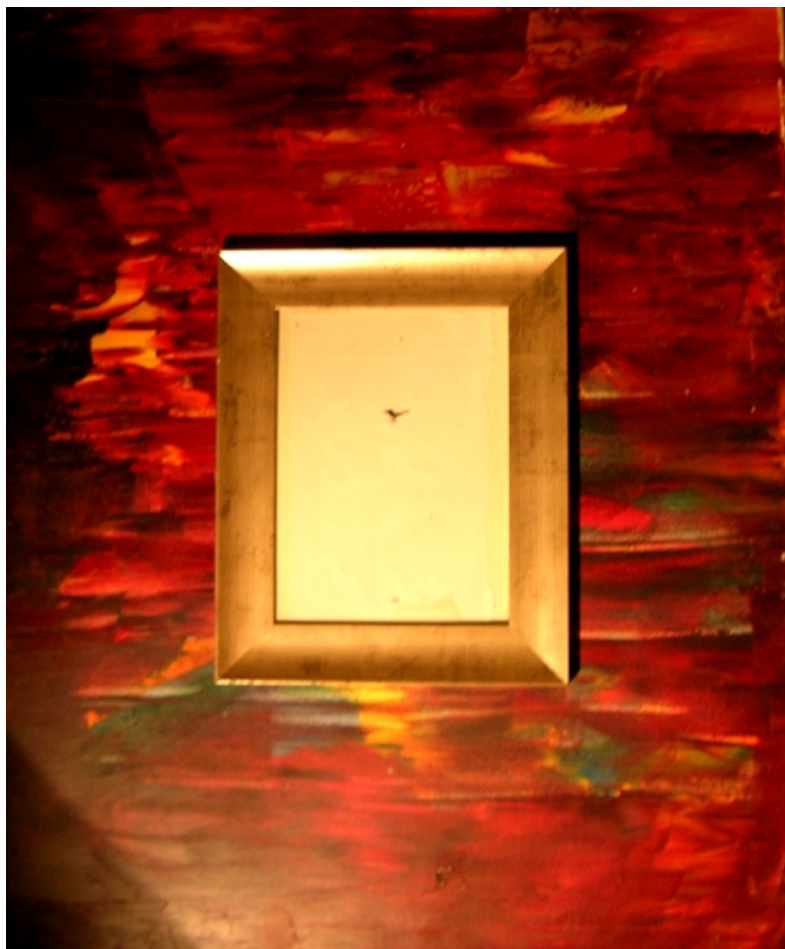
Painting by King Spiros of Plomari, acrylic on canvas, year unknown