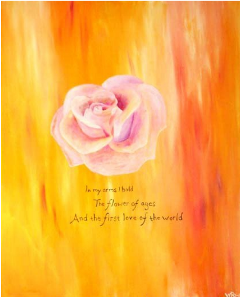
Painting by King Spiros of Plomari, acrylic on canvas, year unknown