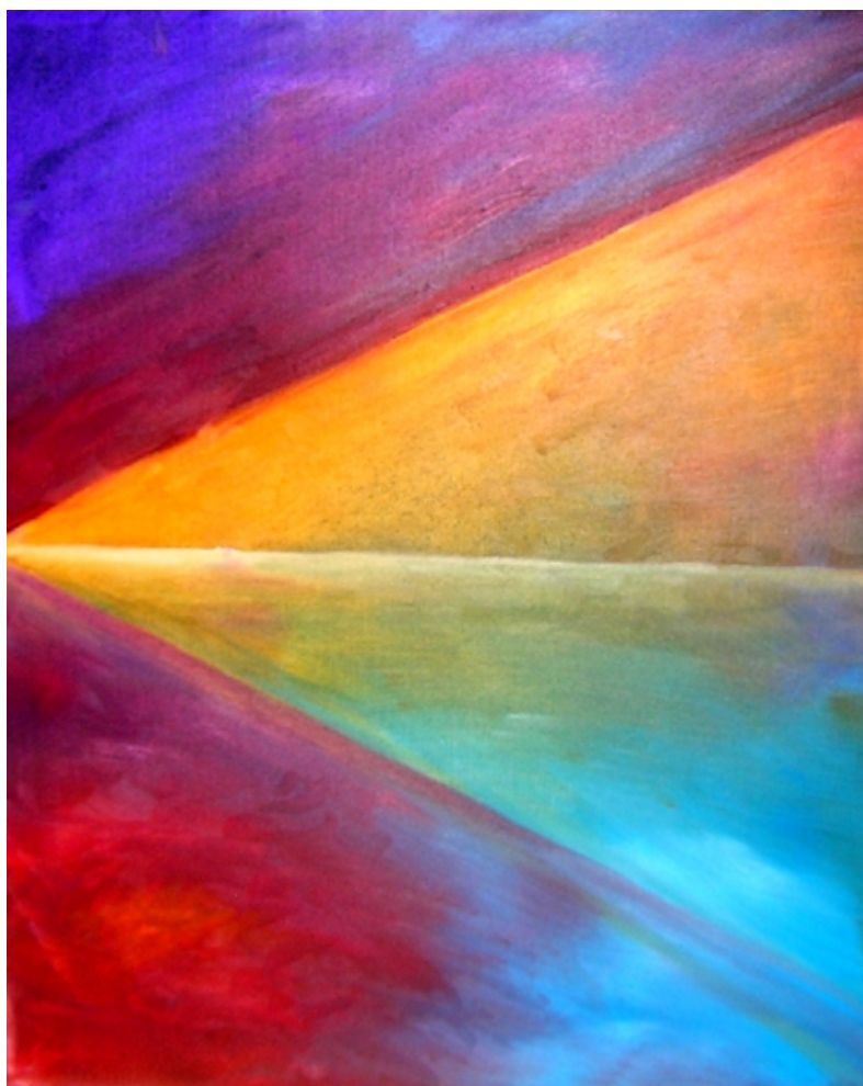
Painting by King Spiros of Plomari, acrylic on canvas, year unknown