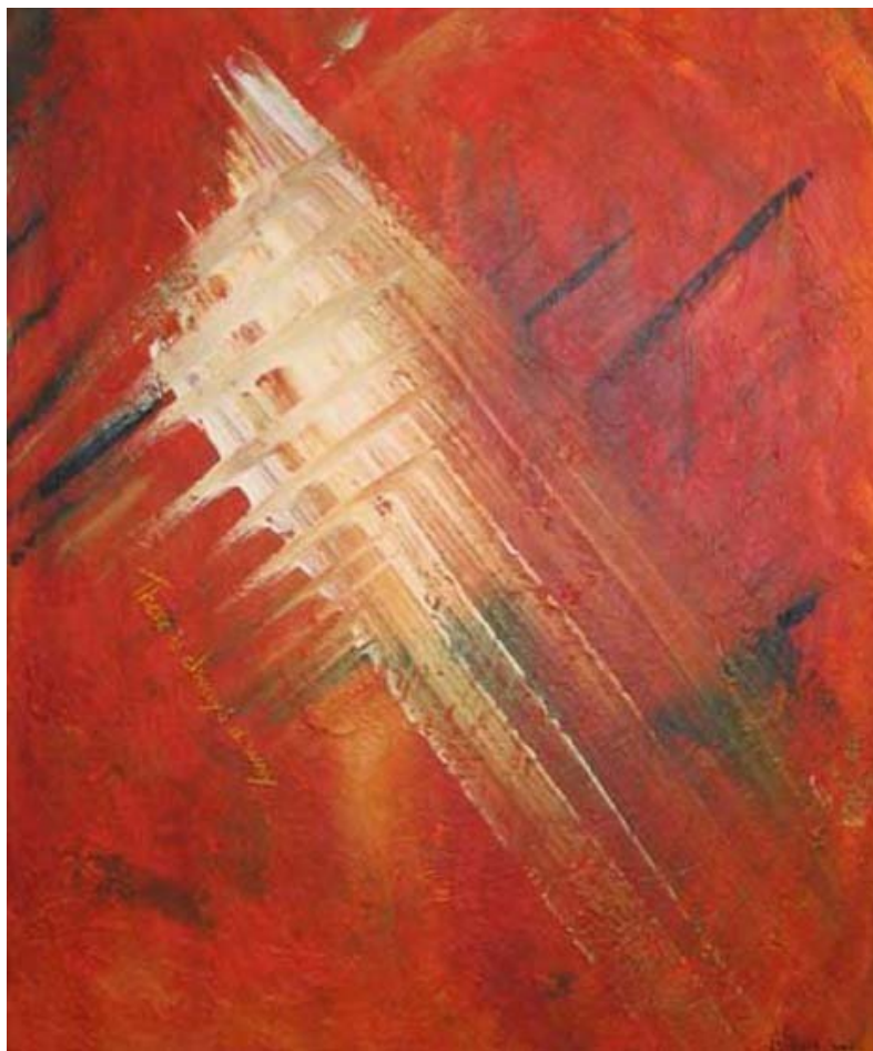
Painting by King Spiros of Plomari, acrylic on canvas, year unknown