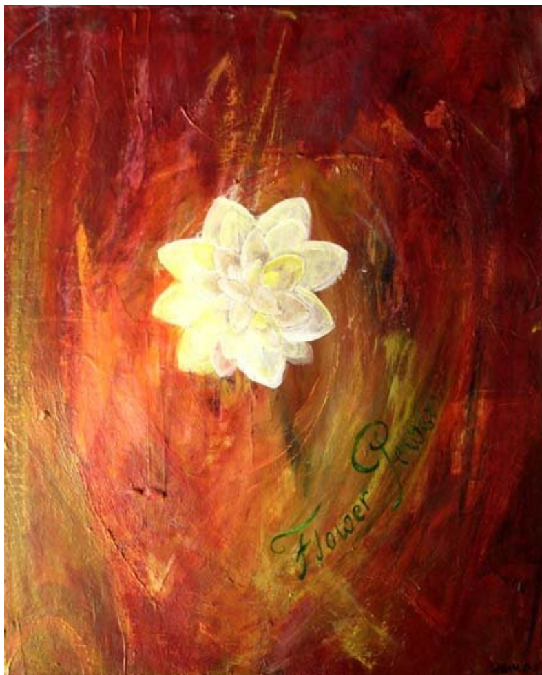
Painting by King Spiros of Plomari, acrylic on canvas, year unknown