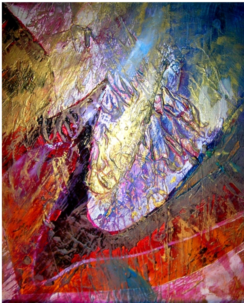
Painting by King Spiros of Plomari, acrylic on canvas, year unknown