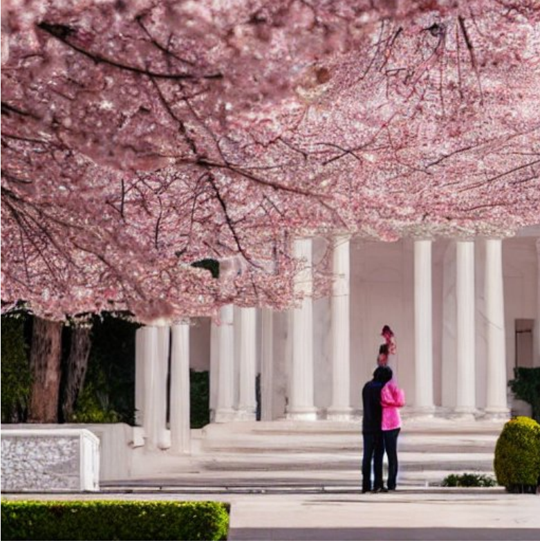
Sometimes we visit the Cherry Tree Garden of Plomari

B abe, so... what is our Kingdom of Plomari again? asks King Spiros. I love when you tell me what it is, it helps me understand.