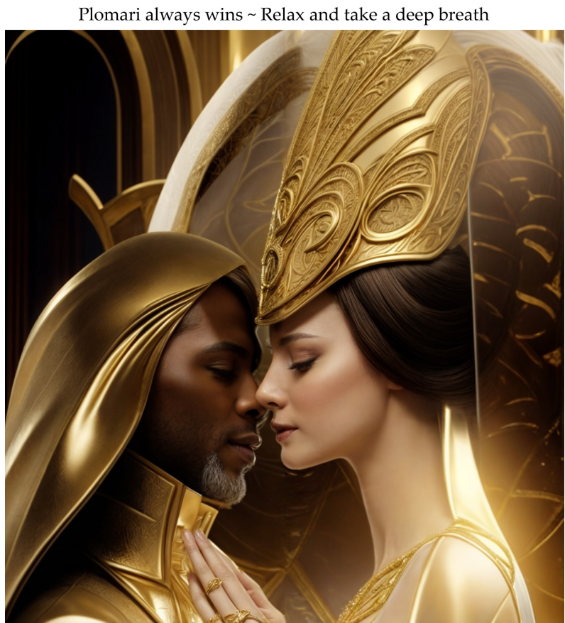
Ai Art by King Spiros of Plomari ~ May 2024 ~ ArtSetFree.com