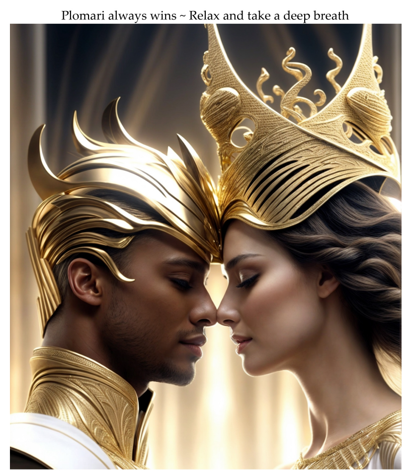
Ai Art by King Spiros of Plomari ~ May 2024 ~ ArtSetFree.com