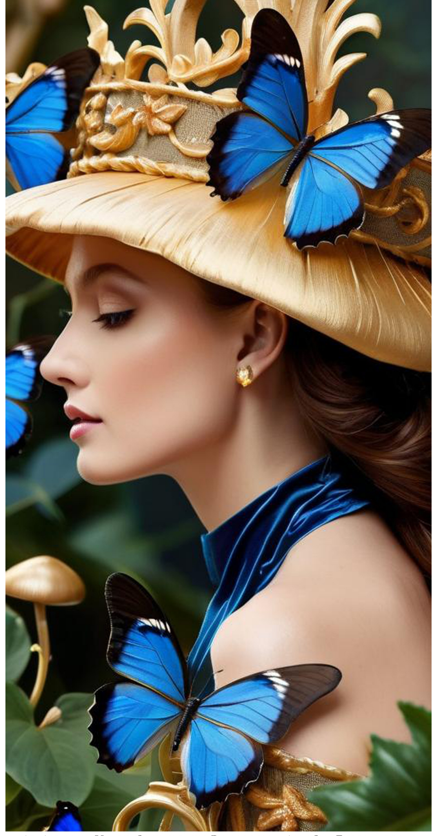
AI ART BY KING SPIROS OF PLOMARI - ARTSETFREE.COM