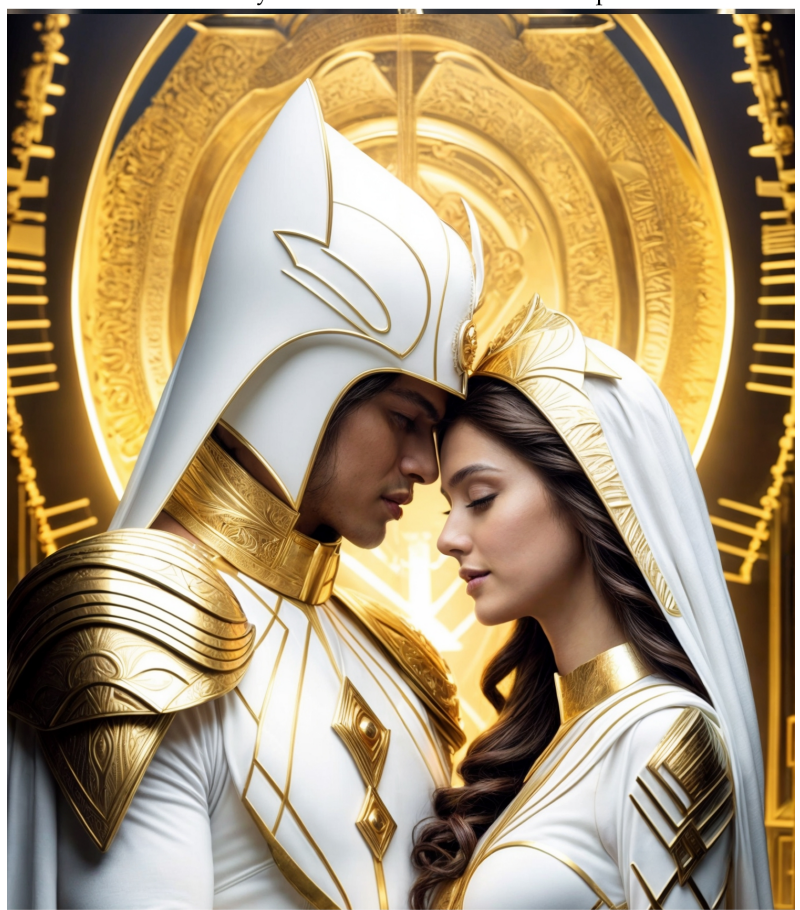
Ai Art by King Spiros of Plomari ~ May 2024 ~ ArtSetFree.com

Plomari always wins ~ Relax and take a deep breath