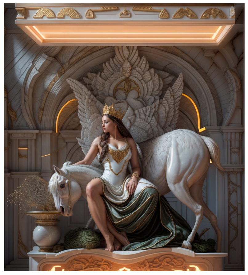
King Spiros of Plomari ~ May 2024 ~ ArtSetFree.com