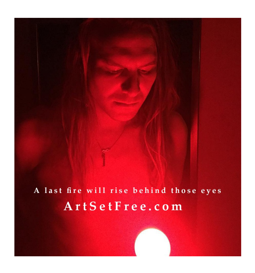
King Spiros staring into the sun